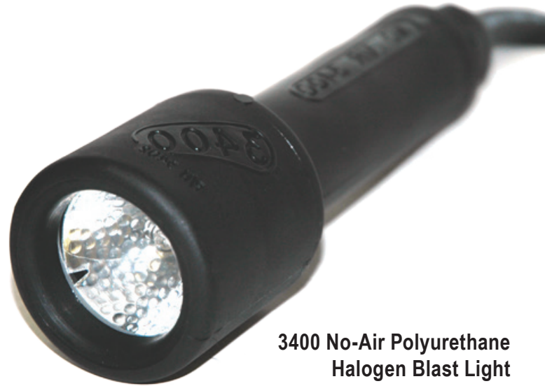
3400 No-Air Polyurethane Halogen Blast Light