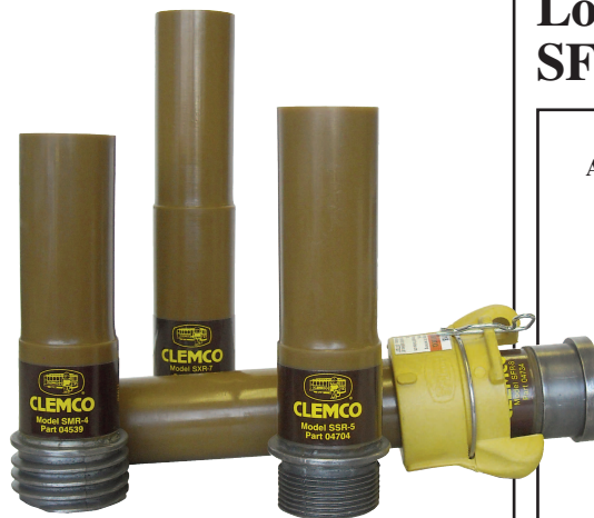
SMR-4 with contractor threads, SXR-7 in rear, SSR-5 with 1-1/4" threads, and SFR-8, flanged, laying down

Blast nozzle with long venturi Clemlite® silicon carbide liner, urethane jacket. Thread size and entry dimensions vary with nozzle series.