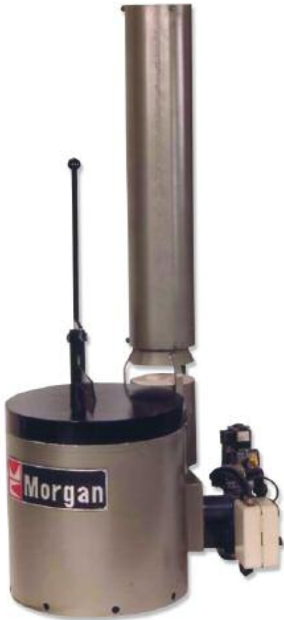
▲ Morgan's Miniature Crucible Furnace.

✓ SUITABLE FOR MANY APPLICATIONS WHERE SMALL QUANTITIES OF MOLTEN METAL ARE REQUIRED AT REGULAR OR IRREGULAR INTERVALS