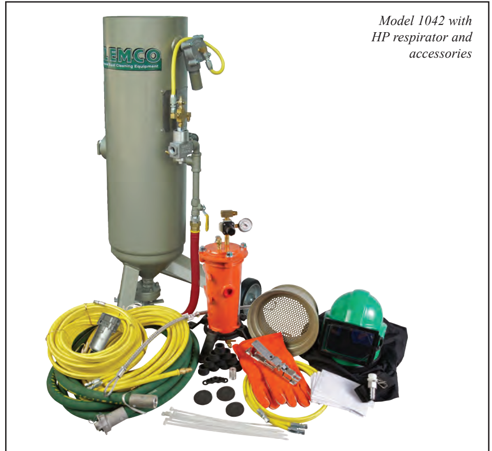
Model 1042 with HP respirator and accessories