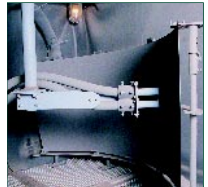
Vertical & Horizontal Oscillator in BNP 720

Heavy-duty construction already makes ZERO cabinets among the quietest you can buy; now we offer additional sound-deadening for applications where noise levels are strictly enforced. Depending on your requirements, our engineers can relocate and muffle the air inlet and exhaust and apply sound-deadening foam to reduce noise levels outside the cabinet.